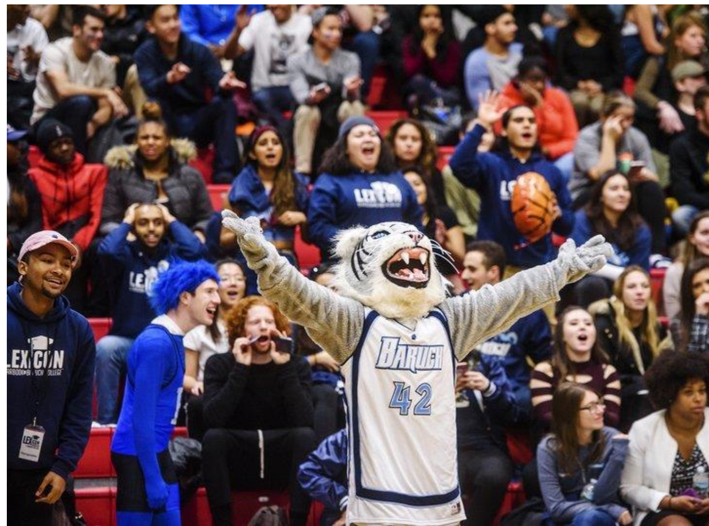
Baruch College's Bearcat cheers on the basketball team.

MONEY encourages students to do the same. In compiling the Best Colleges rankings, we looked at 26 measures that span three general areas: educational quality, affordability, and alumni financial success. In each category, we include at least one measure of the "value added" by a given school — a way of seeing how a college performs after controlling for the average test scores and family income of its student body.