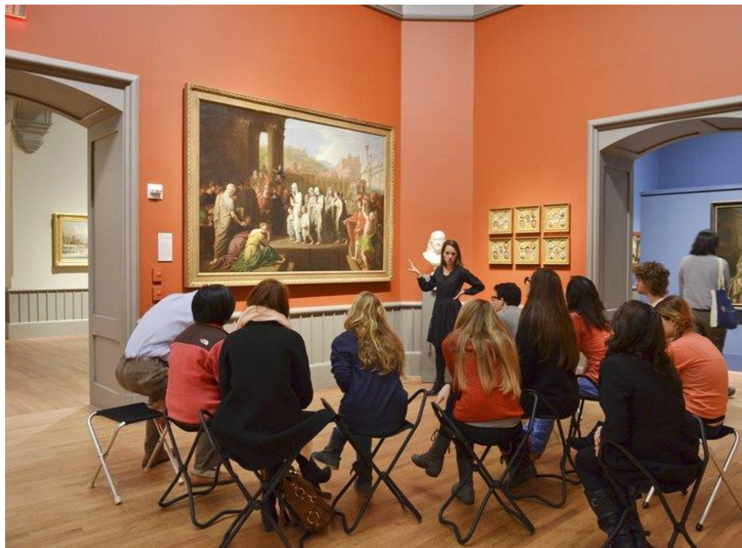
The Yale University Art Gallery. Yale is tied with Princeton for the highest six-year graduation rate in the country — roughly 98%.

Portland's four-year graduation rate is now 75% — up 16 percentage points over the past decade.